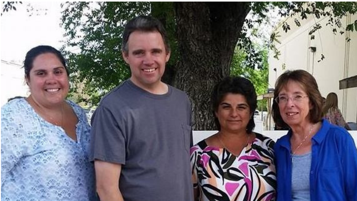
Murrieta Valley Historical Society's executive board members.