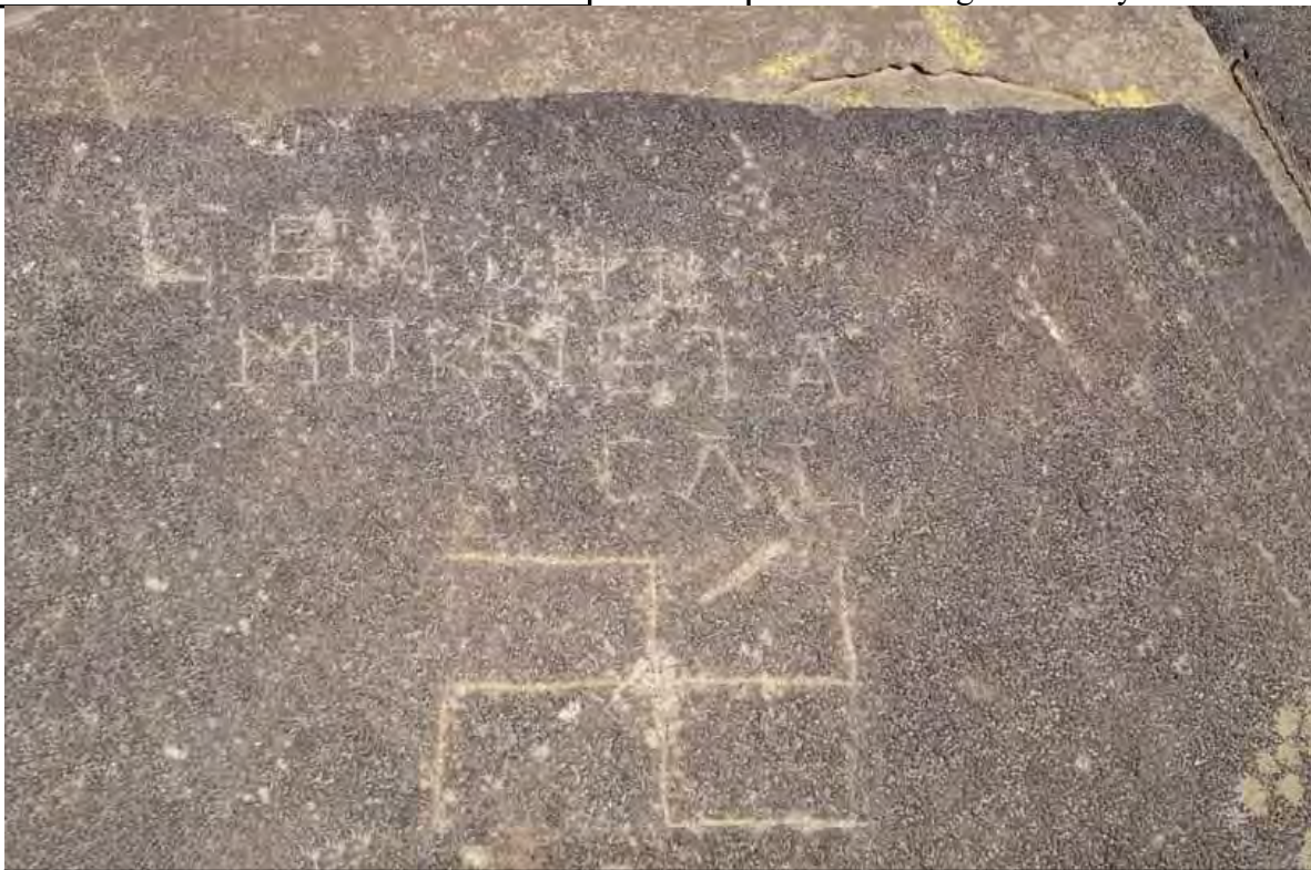
An etching from Los Alamos Heritage rock

For over a hundred years a granite rock formation in French Valley was a treasured landmark, a touchstone to the past where long-ago residents ground acorns and pioneers carved their names and initials. Children climbed the rock and traced the etched markings with their fingers and imagined the people who had touched and climbed the rock long ago. Unfortunately, during a field study for the widening of Clinton Keith Road, an archeologist misinterpreted the etchings on the rock that were made over one hundred years old as being “modern graffiti”. This is difficult to understand since the boulders were already identified as Riverside County archaeological site CA-RIV-11585, a site eligible for both California and National Registered Historical Sites. The rock formation was bulldozed on Friday, June 17, 2022, to make a six-lane road extension.