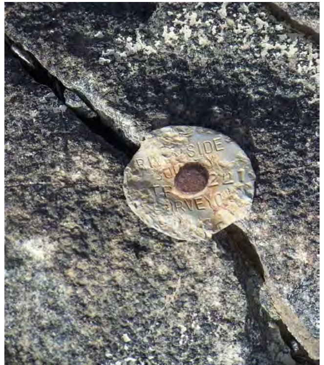
A U.S. Geological Survey marker from the rock.