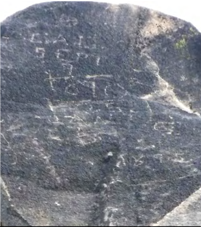
An etching from Los Alamos Heritage rock