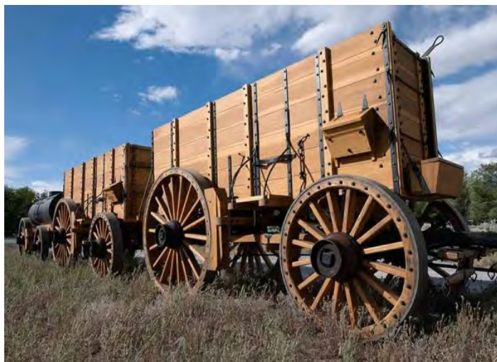
New exact replica set now on display in Bishop, Calif.