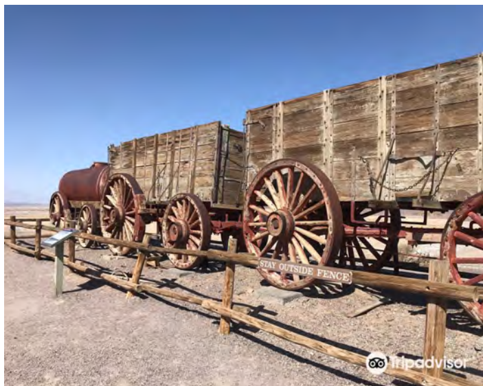
Deteriorating last set of Borax wagons at Furnace Creek.