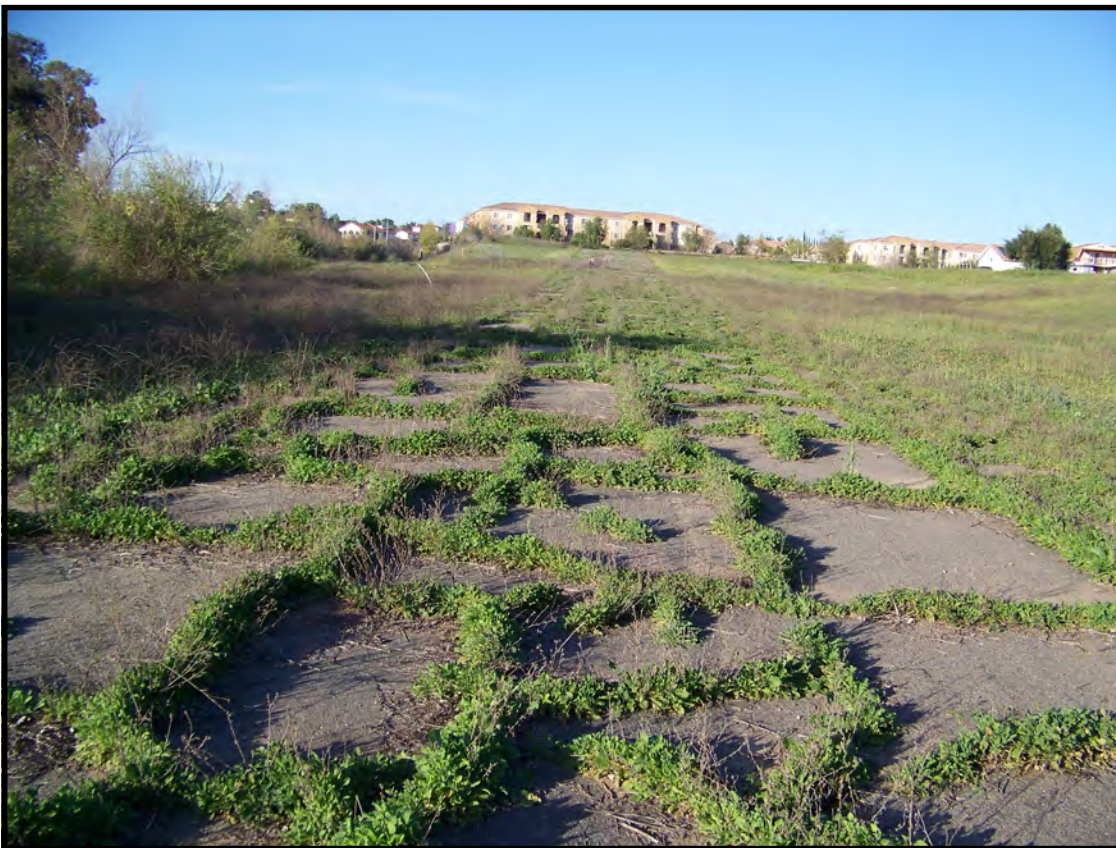
Remnant of the Yoder Airpark runway. The Silverado Apartments can be seen on the horizon.