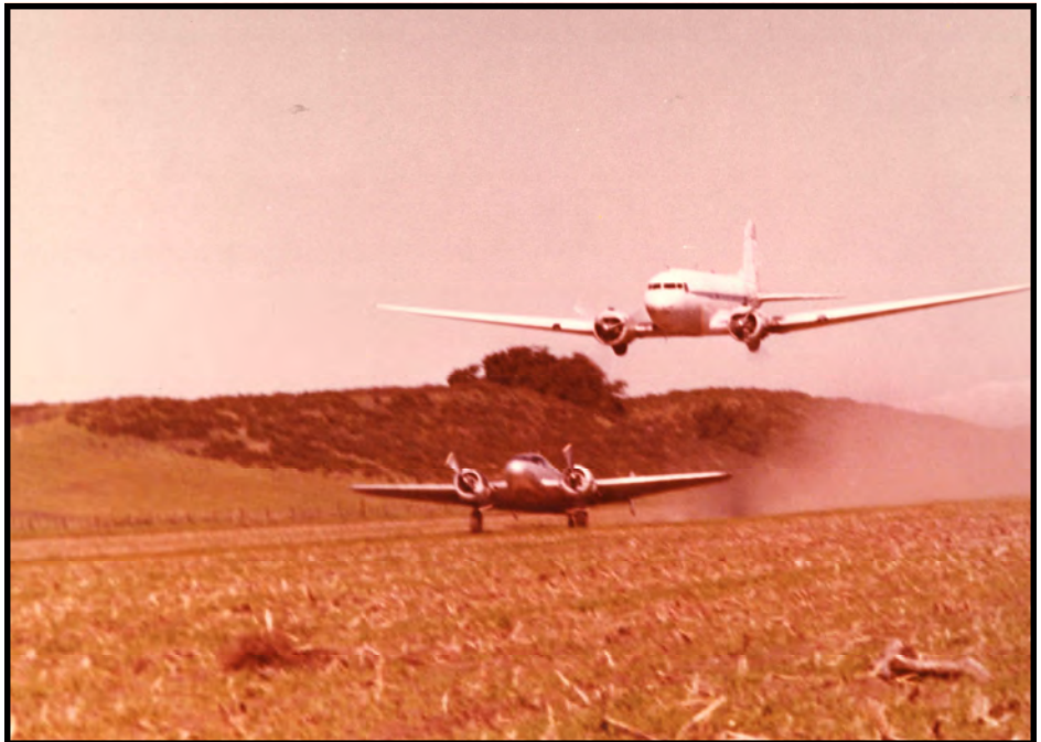
A D-C 3 airplane landing at the Thompson Airport.