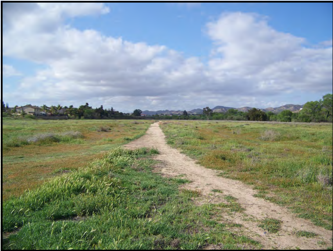
Remnant of the Thompson Airstrip looking north. Housing developments can be seen on both sides of the property. (Photo by Jeffery Harmon, March 12, 2016)

banded. However, local pilots continued to utilize the two Murrieta airstrips.