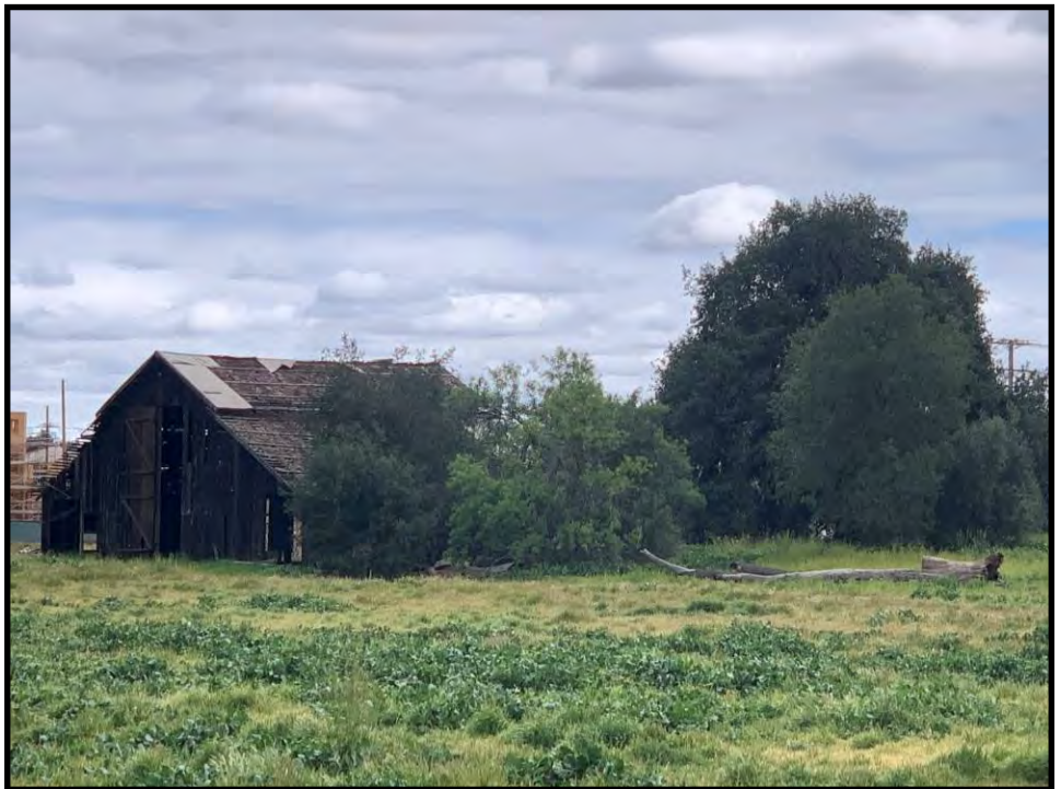
The Sykes barn is all that remains of the former Howard Sykes Ranch.