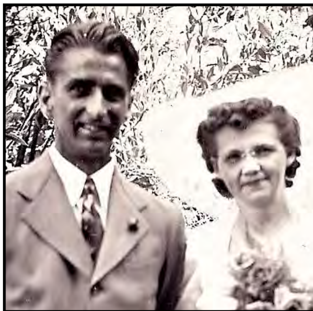
Their wedding day, September 14, 1943