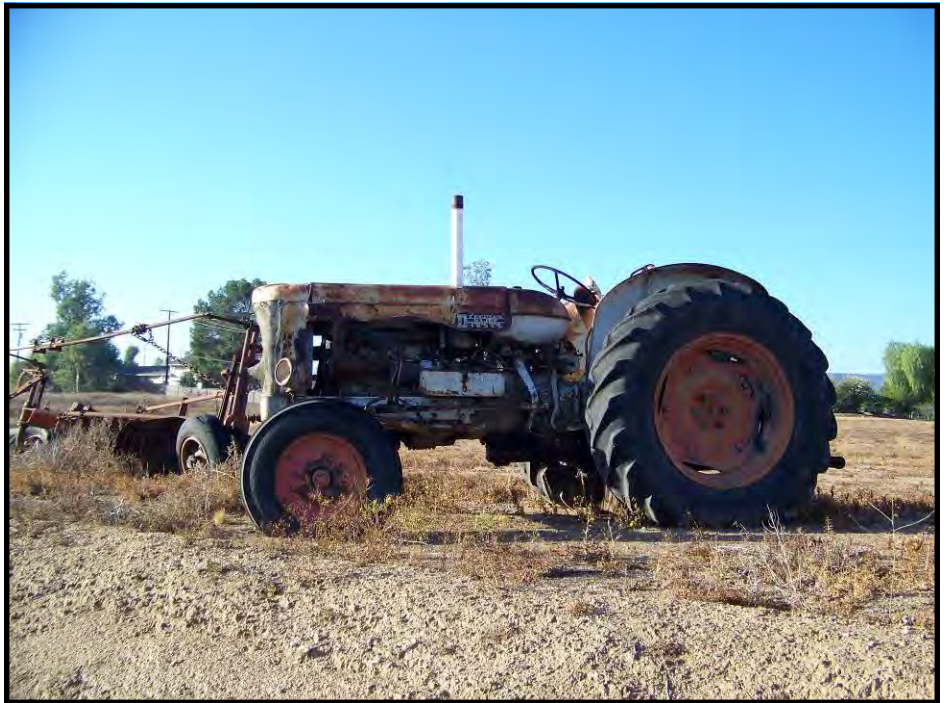
The Sykes tractor and other farm implements can be seen on display on Jefferson Ave.

For over 135 years, four generations of the Sykes family have lived in the Murrieta Valley. They have raised families, grown crops, operated businesses and contributed to the community's development. They have served in civic duties, volunteered their services, and gave when there was a need. The Sykes legacy should be remembered and celebrated for generations to come.