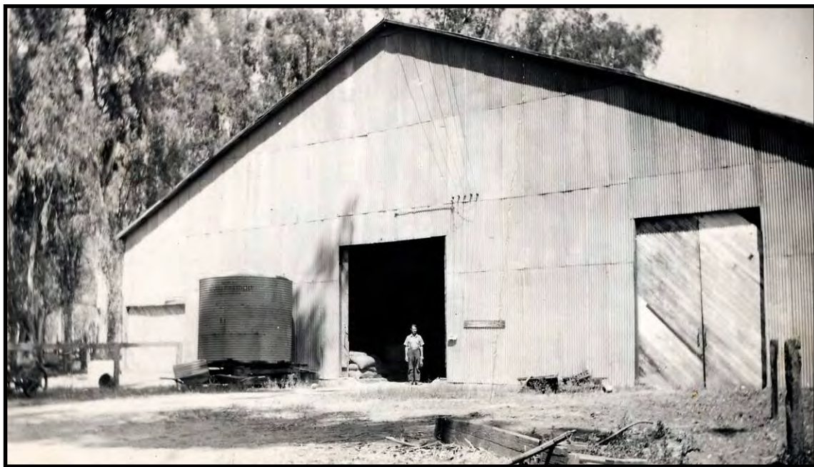
Amos Sykes stands in front of the Sykes Ranch barn. The eucalyptus grove is behind the barn.

Most of the Sykes Ranch is now covered with rows of tract homes. Sykes Park is all the remains of the former ranch. Visitors to the park see the remnants of the ranch, and wonder about the property's history. A future project is planned to install plaques at the park in order to share the Sykes family history. Through preservation efforts the legacy of the Sykes family will be shared with future generations to come.