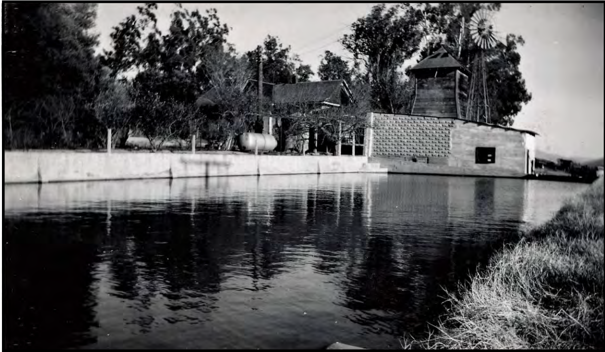
The Sykes Ranch reservoir, tank house, and farm house. The reservoir was built around 1924. It was 109 feet by 54 feet and 6 feet deep.