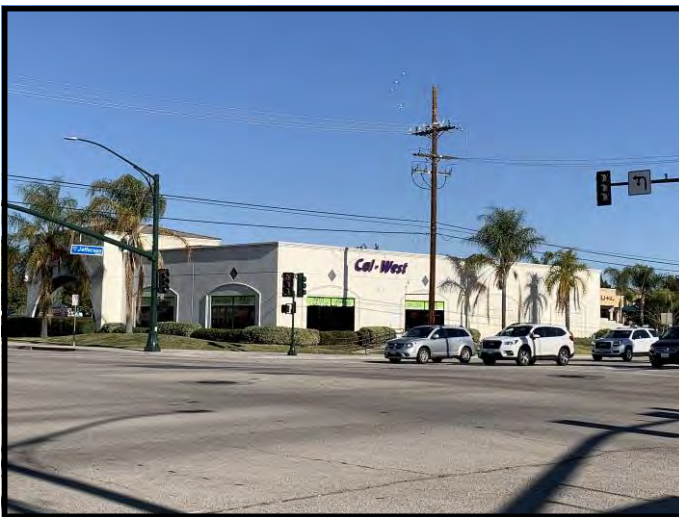
Modern day location of Farthing's Corner at the intersection of Jefferson Avenue and Los Alamos Road/Ivy Street