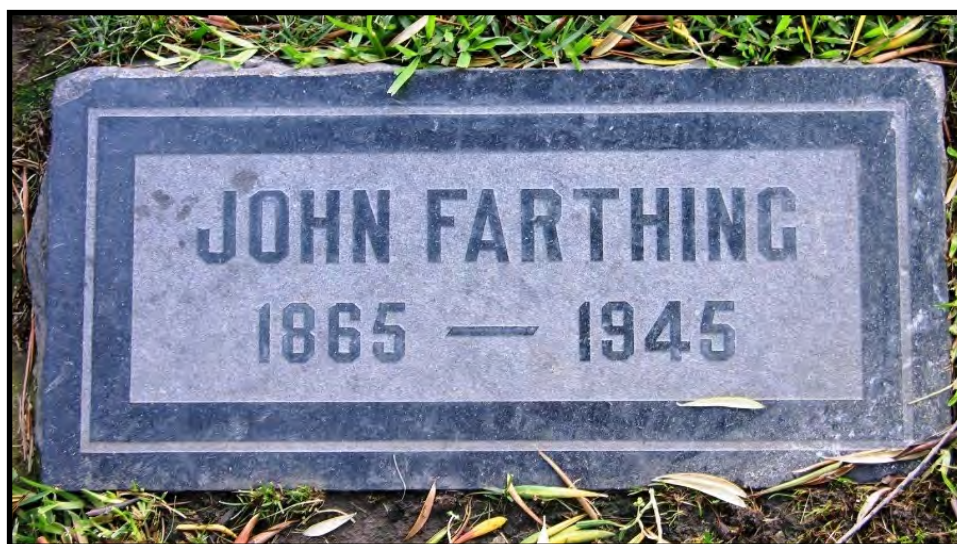
John Farthing grave marker