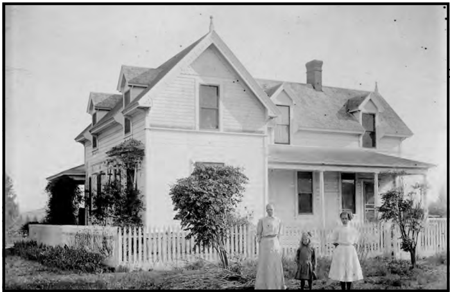
The Rail home in Murrieta. It is located on the corner of Washington Avenue and Ivy Street.