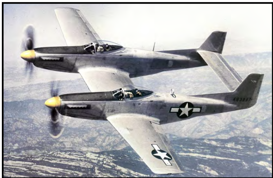
The North American F-82G Twin Mustang