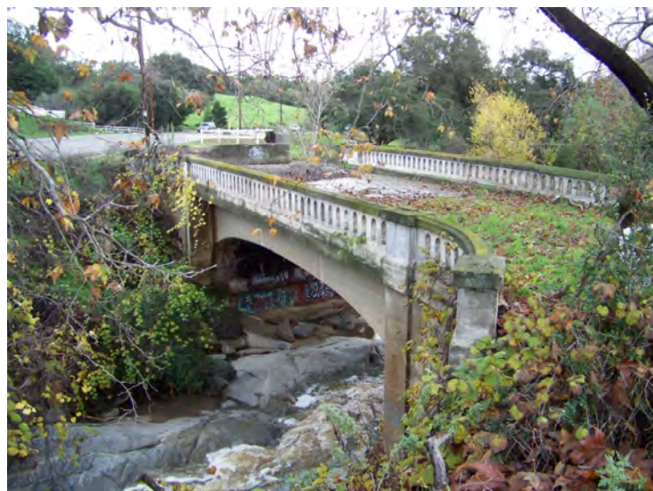
The Ostrich Creek Bridge

To learn more about Historic Route 395 visit: http://www.floodgap.com/roadgap/395/